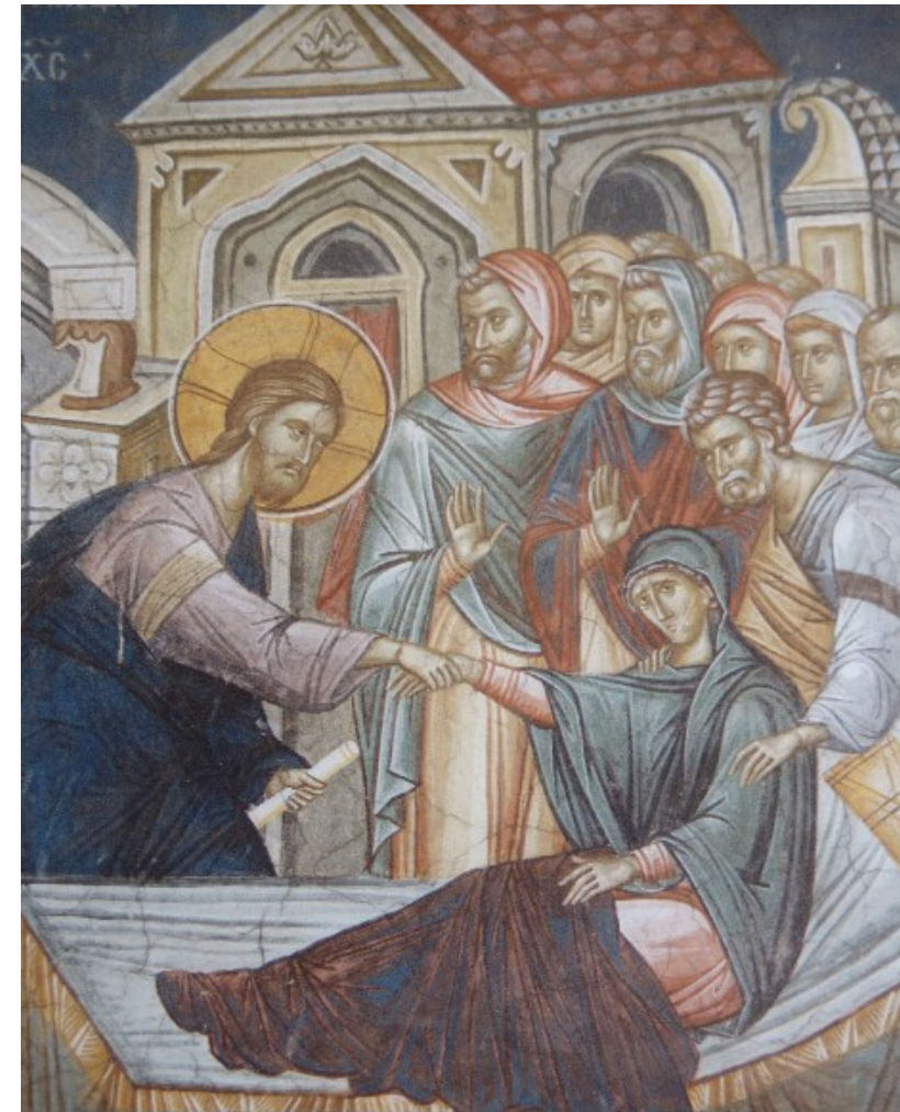
Jesus heals Simon Peter's Mother-in-law