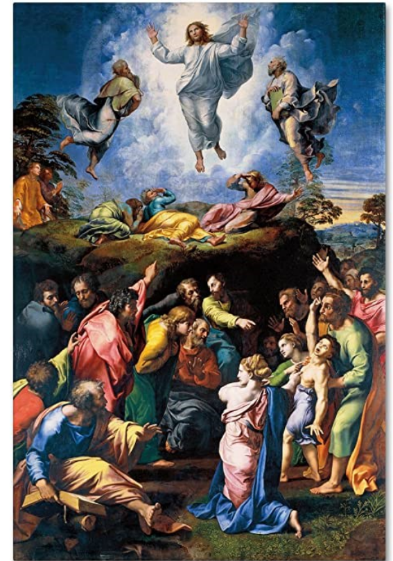
The Transfiguration by Raphael (Raffaello Sanzio da Urbino) (1483-1520)