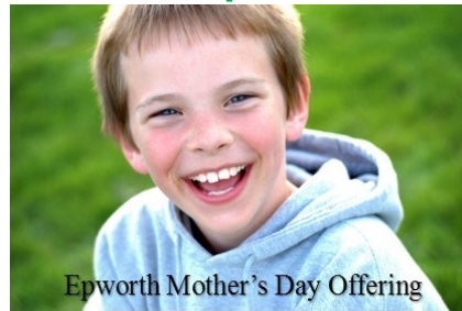
Epworth Mother's Day Offering

TRANSFORM A CHILD'S FUTURE. Each year, Epworth Children's Home provides care to children in our own communities who have experienced abuse, neglect, and loss. Epworth's care breaks the destructive cycle and encourages