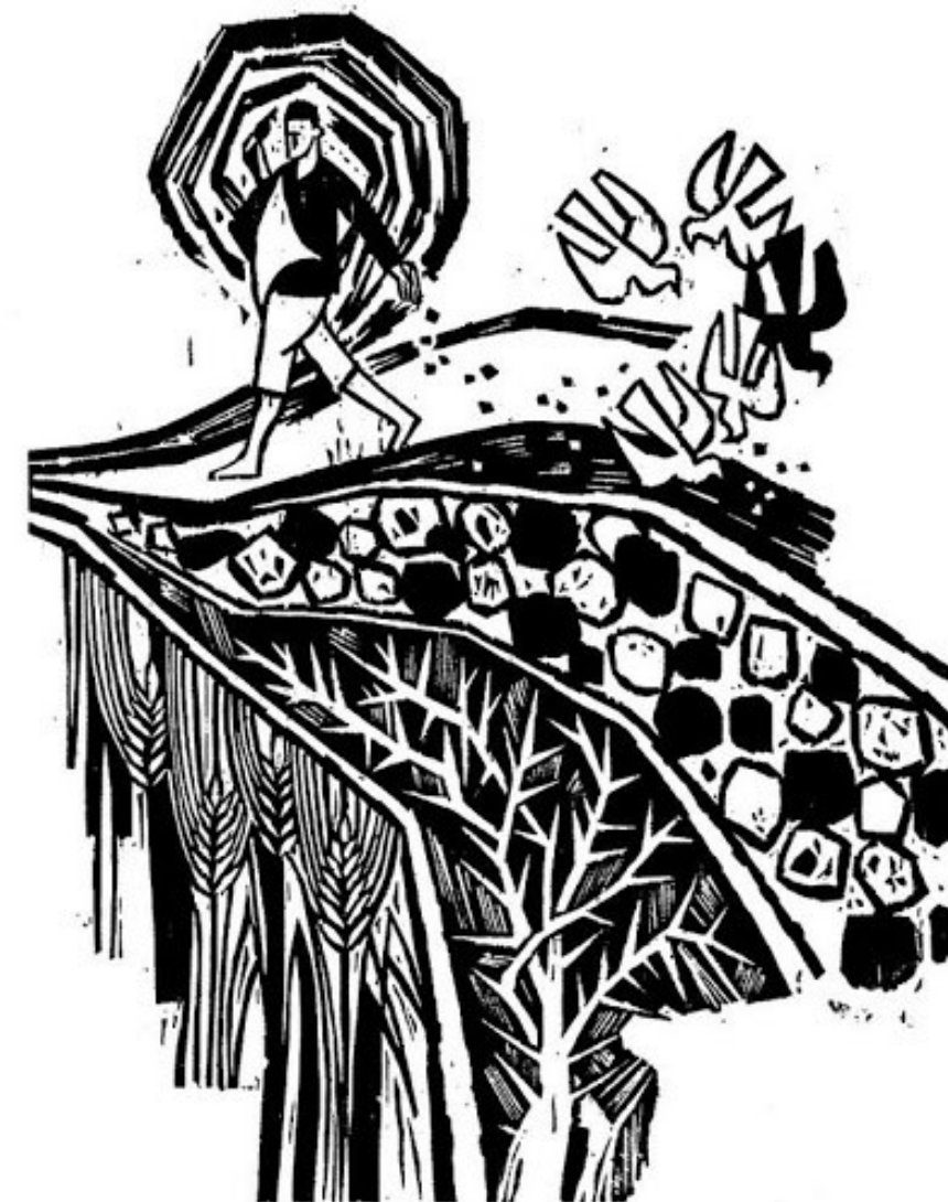
The Parable of the Sower