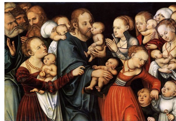
Let the Little Children Come to Me, Cranach, Lucas 1537