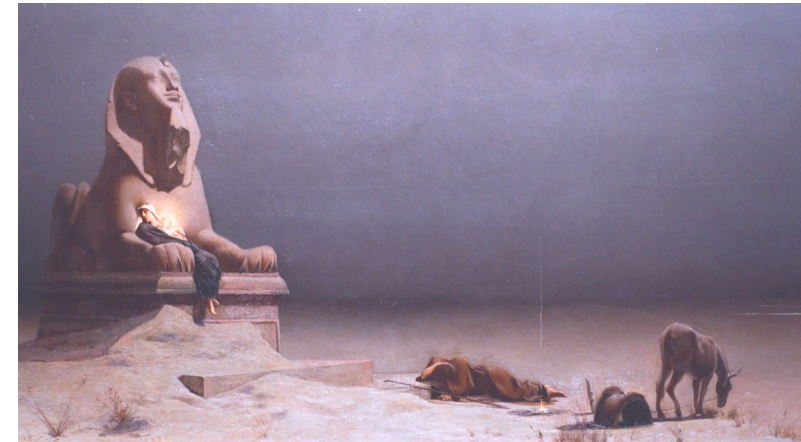
The artist is Luc Oliver Merson and was painted in 1879. The title of the artwork is: Rest on the Flight to Egypt.